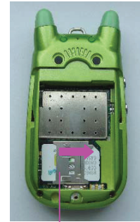
Slide the SIM card cover right and lock it