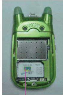
Open the SIM card cover, put in the SIM card