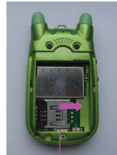
Slide the SIM card cover right and lock it.