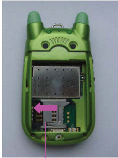
Remove the battery cover and battery, then slide the SIM card cover left