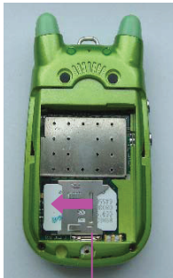
Remove the battery cover and battery, slide the SIM card cover left