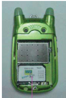
Lift the SIM card cover, take out the SIM card